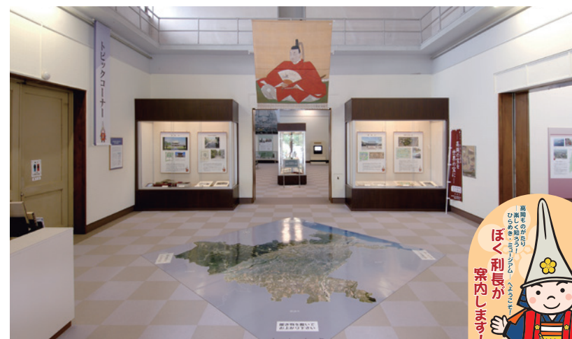
Entrance Hall B