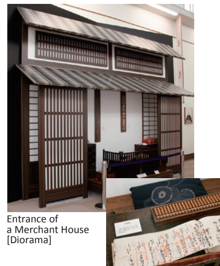
Entrance of a Merchant House [Diorama]