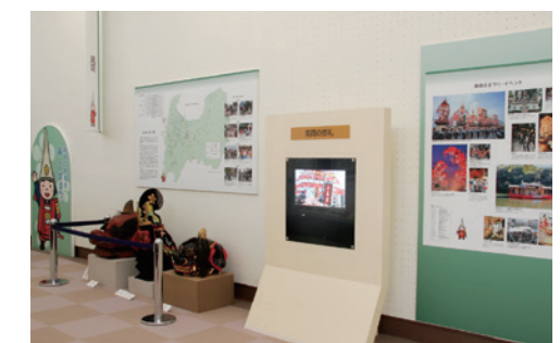
Local Festivals (Shishimai, the Japanese Lion Dance)