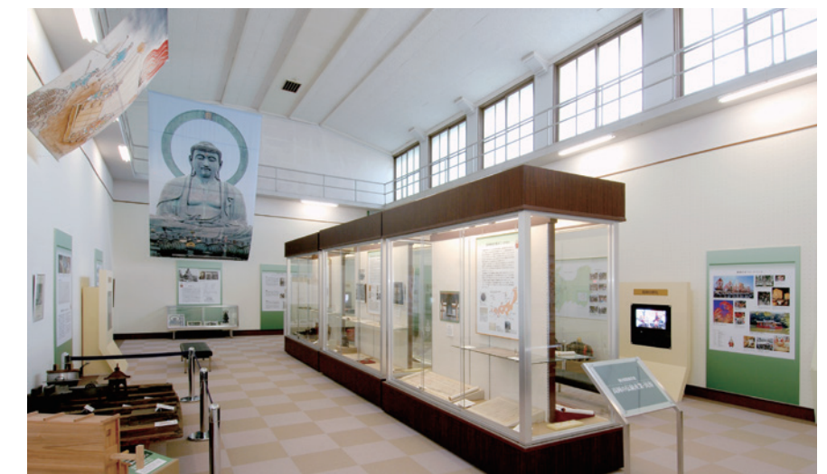
Takaoka Doki [Copperware]

This room introduces Takaoka's copperware and lacquerware industries; traditional crafts dating back to the founding of Takaoka Castle, as well as the local folklore and traditional festivals (Shishimai Festival, Takaoka Mikurumayama Festival, etc.).