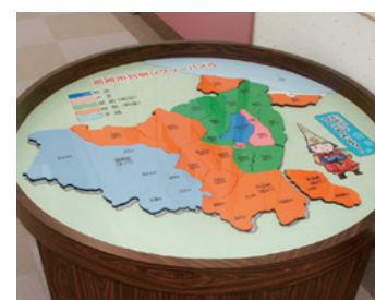
Activity Corner : Jigsaw Puzzle of Takaoka City's Merger