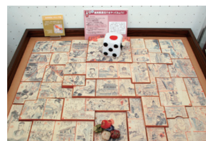
Activity Corner : Try playing the Takaoka Hanjyo Sugoroku [Japanese board game]