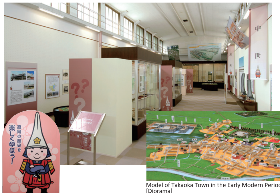
Model of Takaoka Town in the Early Modern Period [Diorama]

This room introduces the history of Takaoka: in ancient Japan, the provincial capital of Etchu was located here. In 1609, Takaoka Castle was founded by Maeda Toshinaga, the second head of the Maeda family; lord of the influential Kaga Domain. After the castle was forced to close, Takaoka flourished as a city of commerce and industry.