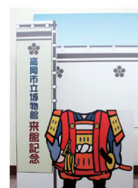
Commemorative Photo Corner