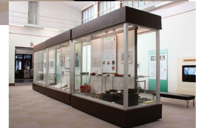
Takaoka Shikki [Lacquerware]