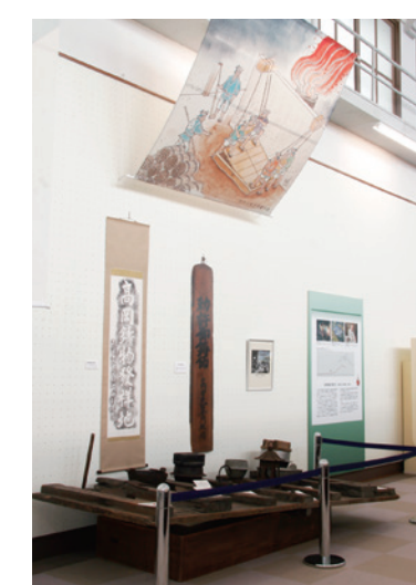
Footboard of Tataru [Traditional Furnace]