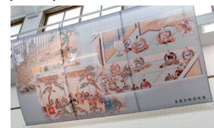
Illustrated Scroll of the Battle of Suemori-jo Castle [Tapestry]