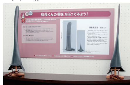
Activity Corner: Try Wearing Toshinaga's Samurai Helmet!