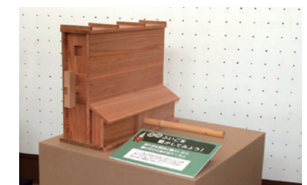
Activity Corner: Try operating the fuigo (air blower)